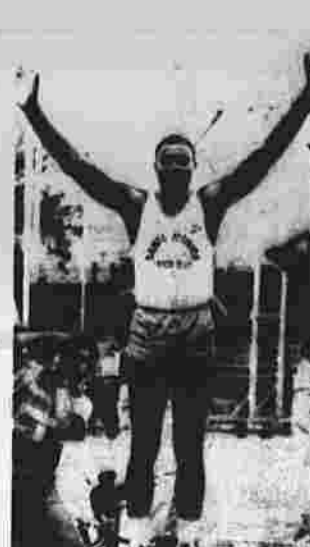
CARL LEWIS second best jump