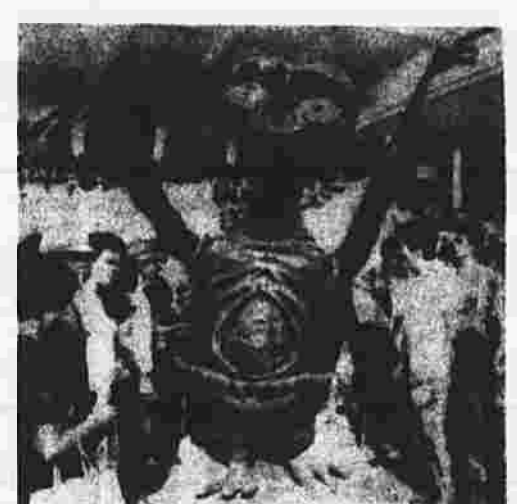
A 10-foot model of E.T. entertains a crowd in Manila Sunday during a campaign to raise funds to help out-of-school youths in the Philippines.

This is in, skinny is out. So says John Casablancas, who heads the Elite Group of International Model Agencies. Casablancas has launched "The Look of 1983," a search for models in 20 countries to wind up in a November pageant in Acapulco that will distribute $450,000 in prizes.